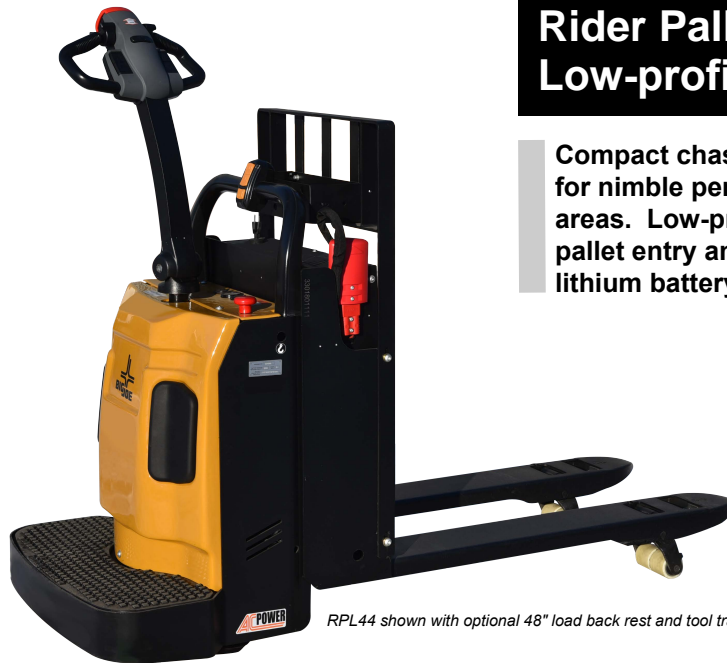
RPL44 shown with optional 48" load back rest and tool tray

Compact chassis & power steering for nimble performance in tight areas. Low-profile forks for easy pallet entry and exit. Integrated lithium battery and charger